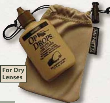
For Dry Lenses