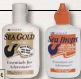
For Wet Lenses